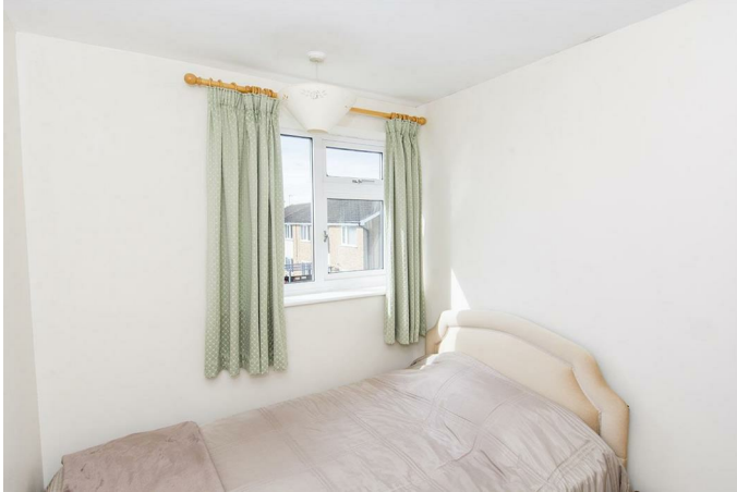
UPVC double-glazed window to rear. Radiator.