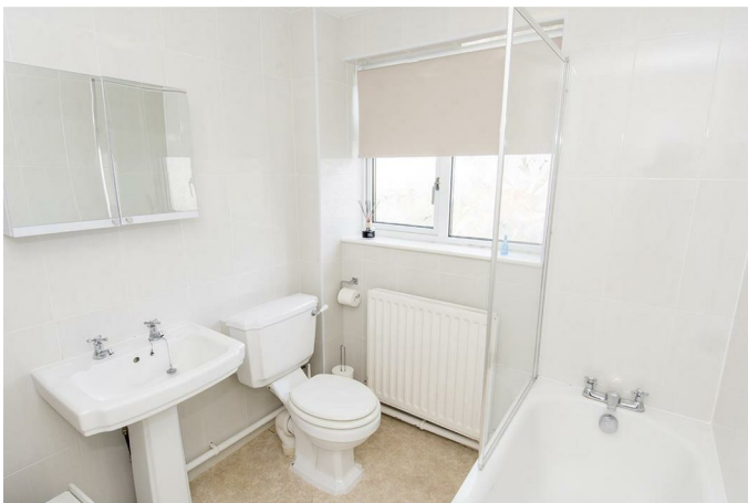
Opaque UPVC double-glazed window to front. White

three piece suite comprising wc, wash hand basin and panelled bath. Tiled walls. Radiator.